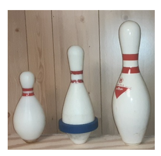
Comparison: A duckpin, a fivepin, and a tenpin

The pins all have rubber bands around the bellies, which is akin to the rubberband duckpin game (which we will be discussing in an