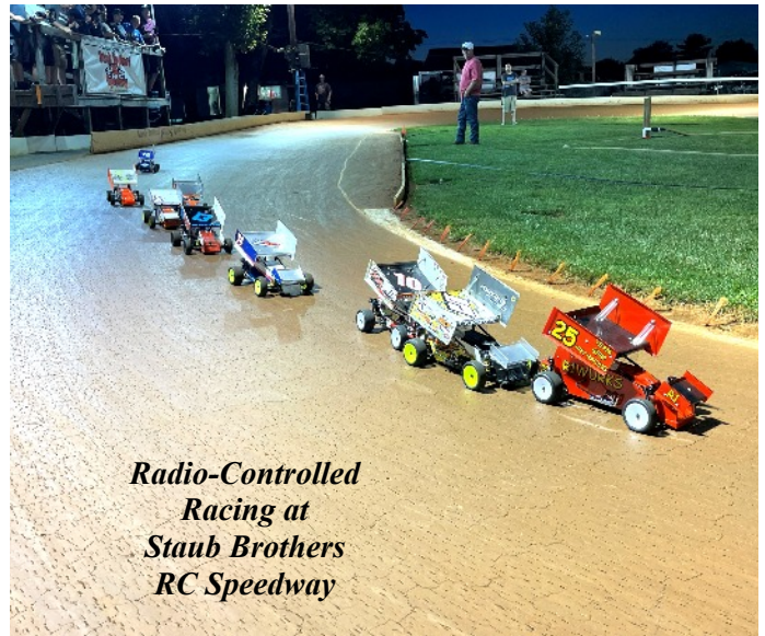
Radio-Controlled Racing at Staub Brothers RC Speedway